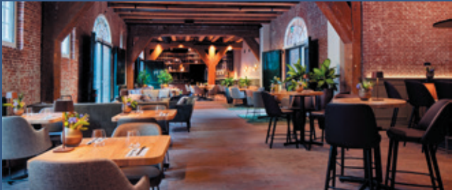
Gastrobar de Wapenkamer Ground level

Welcome to Gastrobar de Wapenkamer in the historic Hotel Arsenaal. This is how we wrote in the early 1600s. hotel Arsenaal houses many canons, firearms, bullets and other weaponry. Not only did the building serve as an armory, but also goods such as spices, cotton, coffee, tea and Chinese porcelain. An armory of value you might say! A place where you can enjoy a good wine in combination with luxury snacks and with a nod to the history.